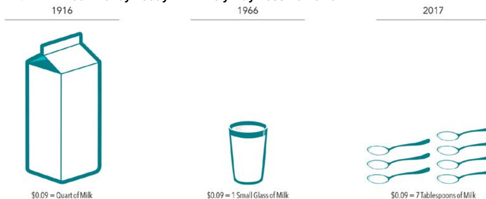
Exhibit 1. Your Money Today Will Likely Buy Less Tomorrow

This erosion of the real purchasing power of wealth is called inflation. Inflation is an important element of investing. In many cases, the reason for saving today is to support future spending. Therefore, keeping pace with inflation is a crucial goal for many investors. To help understand inflation's impact on purchasing power, consider the following illustration of the effects of inflation over time. In 1916, nine cents would buy a quart of milk. Fifty years later, nine cents would only buy a small glass of milk. And more than 100 years later, nine cents would only buy about seven tablespoons of milk. How can investors potentially prevent this loss of purchasing power from inflation over time?