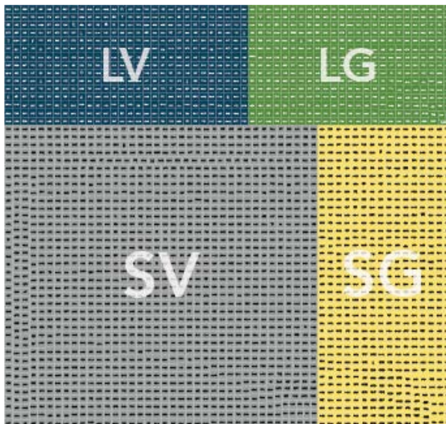
Exhibit 2. US Stocks Sized Equally

For illustrative purposes only. Illustration includes the constituents of the Russell 3000 Index as of December 31, 2016 on an equal-weighted basis segmented into Large Value, Large Growth, Small Value, and Small Growth. Source: Frank Russell Company is the source and owner of the trademarks, service marks, and copyrights related to the Russell Indexes. Please see Appendix for additional information.