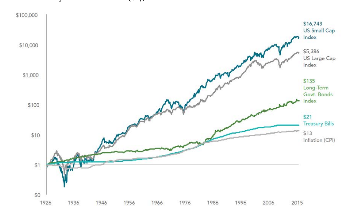
Exhibit 1. Monthly Growth of Wealth ($1), 1926–2015

Past performance is no guarantee of future results. Indices are not available for direct investment. Their performance does not reflect the expenses associated with the management of an actual portfolio. See Index Definitions in the Appendix for more information. US Small Cap Index is the CRSP 6–10 Index; US Large Cap Index is the S&P 500 Index; Long-Term Government Bonds Index is 20-year US government bonds; Treasury Bills are One-Month US Treasury bills; Inflation is the Consumer Price Index. CRSP data provided by the Center for Research in Security Prices, University of Chicago. Bonds, T-bills, and inflation data provided by Morningstar.